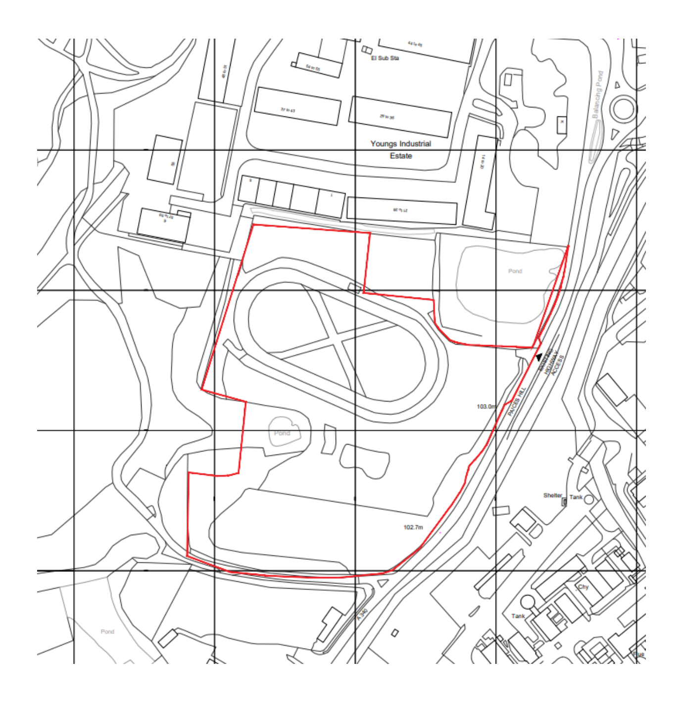
Site Location Plan (application reference 20/02527/OUTMAJ).