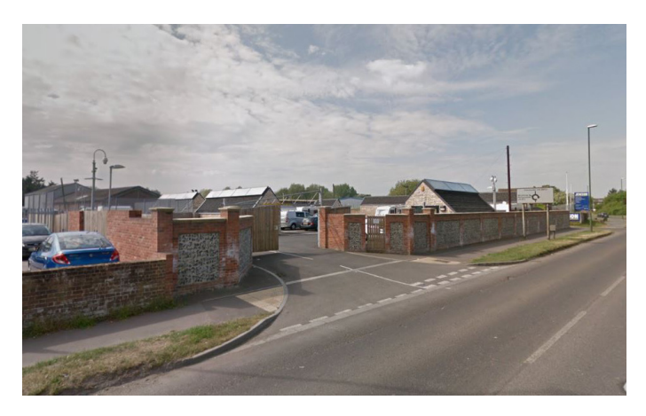
Gypsy & Traveller Transit Facility, Westhampnett, West Sussex

The existing Transit Park facility at Westhampnett in West Sussex provided a useful reference project and has proven most successful.