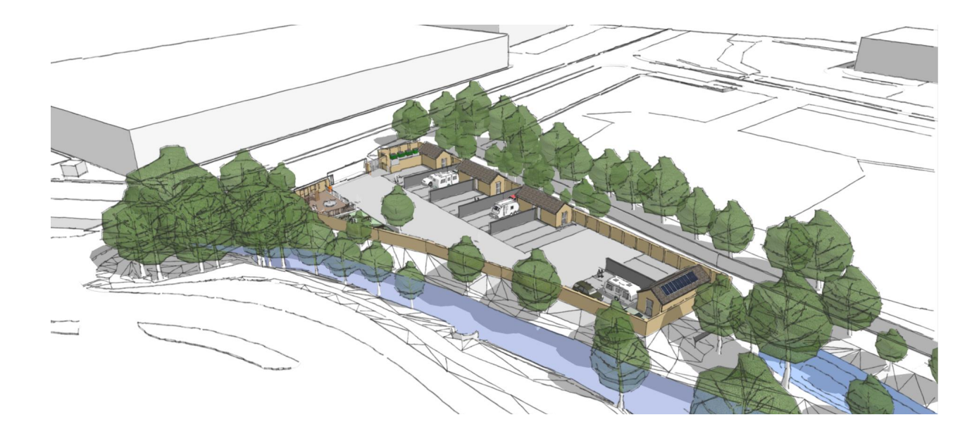
Aerial View Looking North East