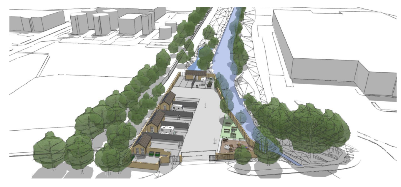
Aerial View Looking South

be polyester powder coated. Solid full height double timber gates are provided to the bin area to facilitate easy waste collection.