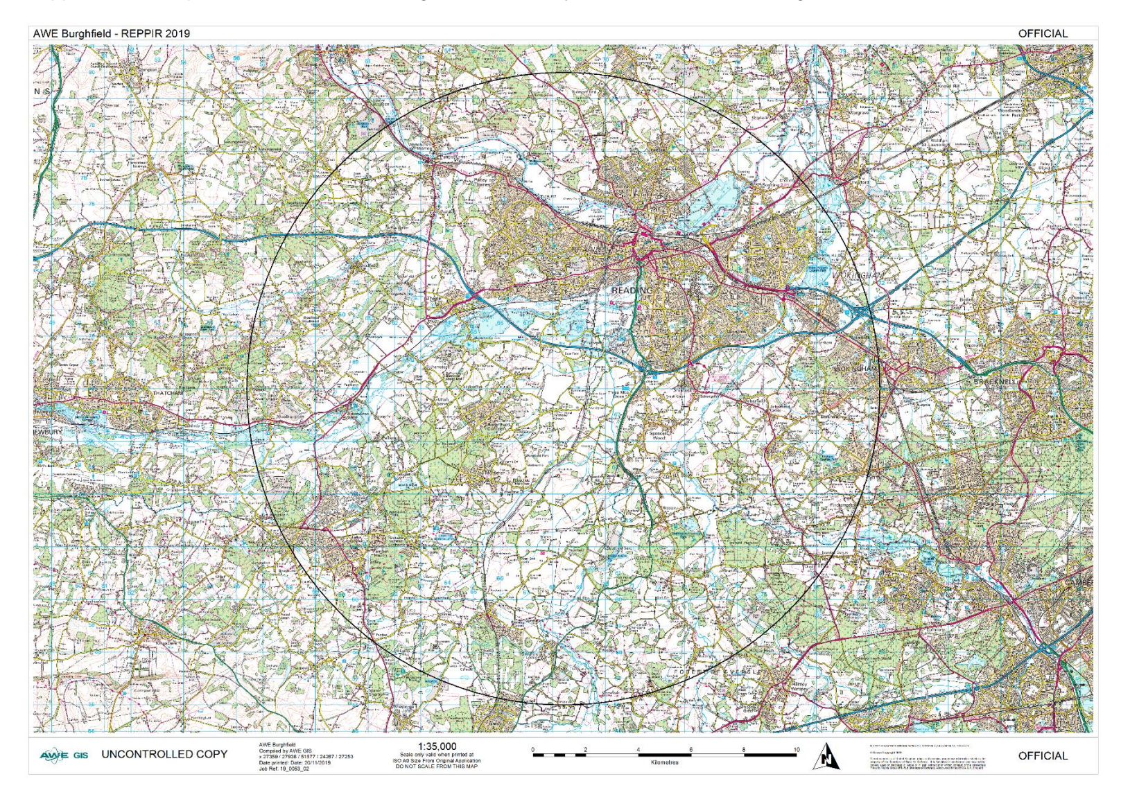
Appendix B: Map B – The Outline Planning Zone Boundary, set at 12Km for the Burghfield Site.