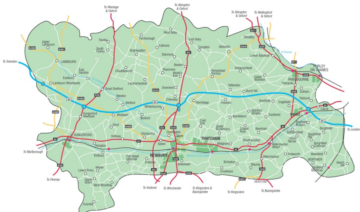
Figure 1.1 West Berkshire

1.10 Employment provision is diverse. West Berkshire has a strong industrial base, characterised by new technology industries with a strong service sector and several manufacturing and distribution firms. The areas that have the highest concentrations of employment are Newbury Town Centre and the industrial areas and business parks in the east of Newbury, the business parks at Theale, Colthrop industrial area east of Thatcham and the Atomic Weapons Establishments at Aldermaston and Burghfield.