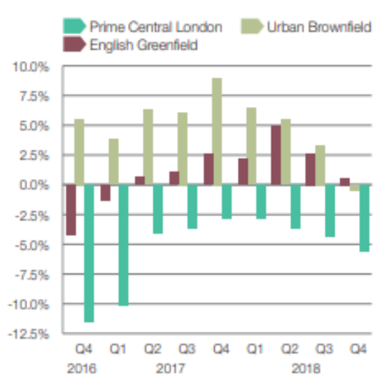
FIGURE 2 Annual change in average land values