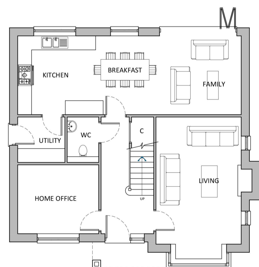
PLOT 16 GROUND FLOOR PLAN