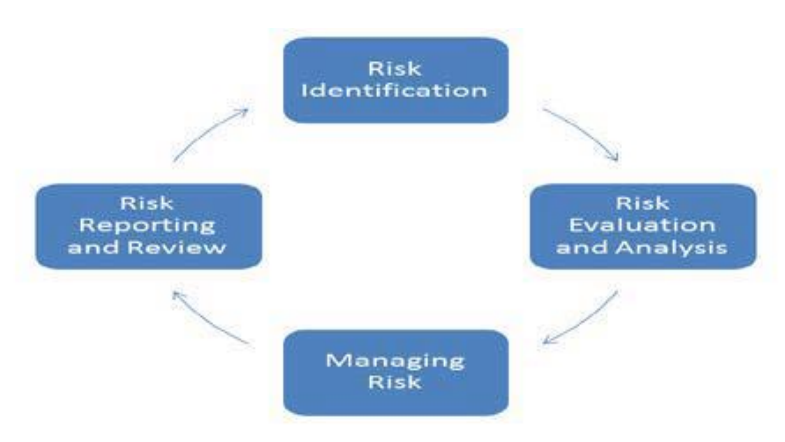
Graph 2 Risk Management process