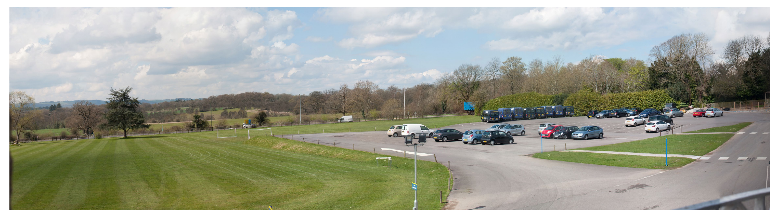
Viewpoint 8b: 15 years after planting from Sandleford Priory, First floor window from St Gabriel's School looking west towards the site. No new houses in the proposed development visible.