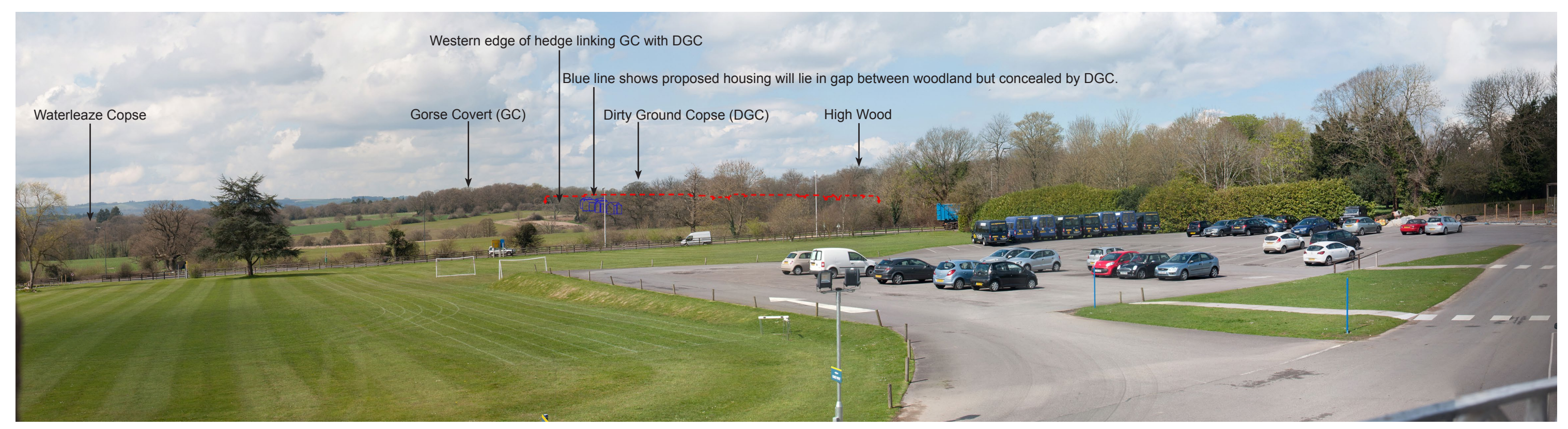
Viewpoint 8b: Existing view with no proposed planting shown. Redline indicating the location of the development screened behind existing retained vegetation and woodland.