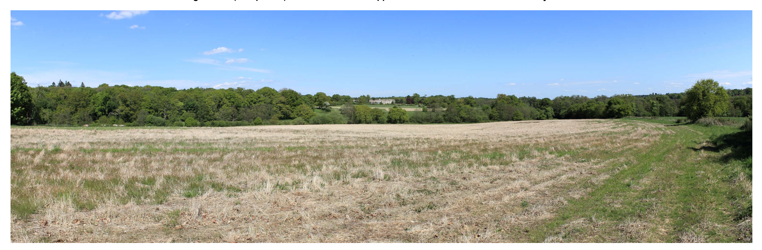
Figure 9.18 (Viewpoint 5): View South-east Towards the Site of the Walled Garden