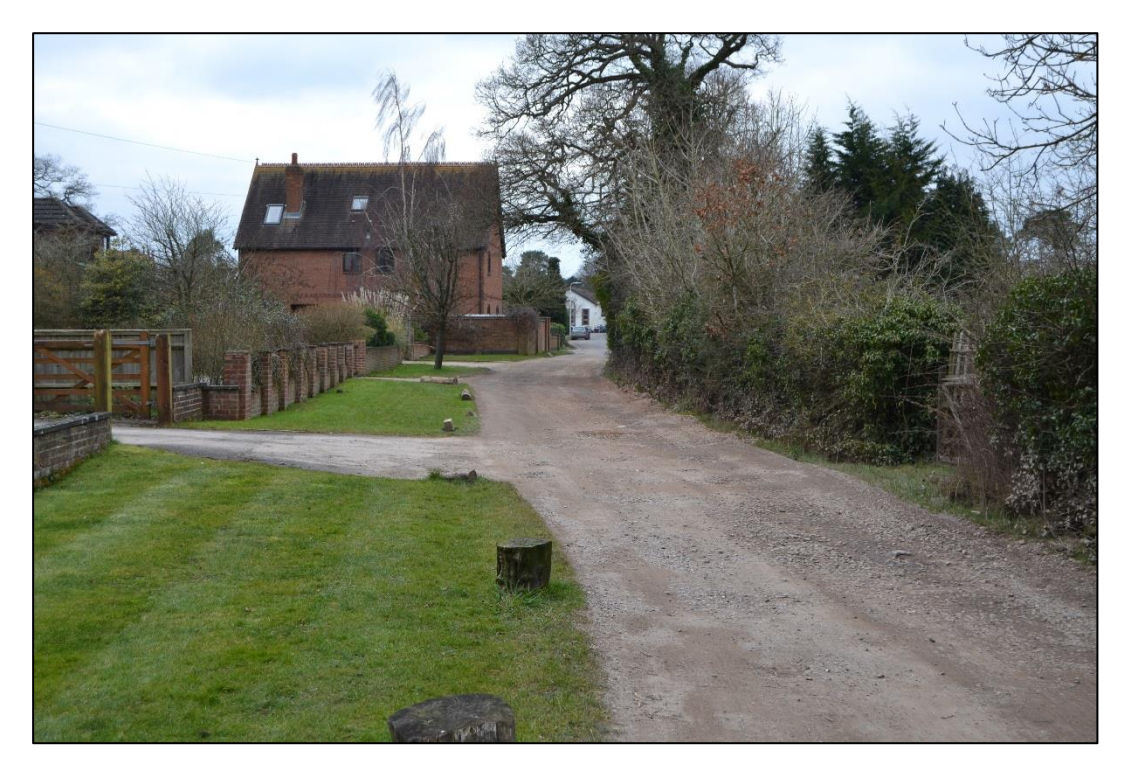
Figure 3 Warren Road

Nearby facilities include local shops at Wash Common, larger shops, cafes and restaurants in Newbury town centre and at Newbury Retail Park, Newbury Rugby Club, David Lloyd Fitness, Newbury College, Park House School, Falkland Primary School and a frequent bus service along Andover Road. Newbury train station is approximately 2.6km away. Town centre facilities are located in central Newbury, approximately 2.8km away.