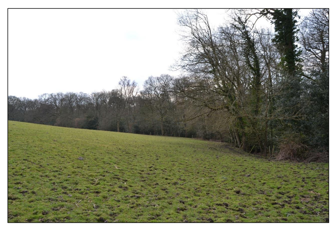
Figure 1 Brick Kiln Copse

2.1 The application site, which extends to 22.5 hectares, is located on the southern edge of Newbury and largely comprises open fields, agricultural land and trees. The fields within the application site are either open or contained by tree lines or woodland copse, the largest being Brick Kiln Copse which runs north-south through the site. This area forms a natural drainage basin for the wider area, with water collecting in the base of the Copse before being carried via a tributary to the River Enborne, south of the site.