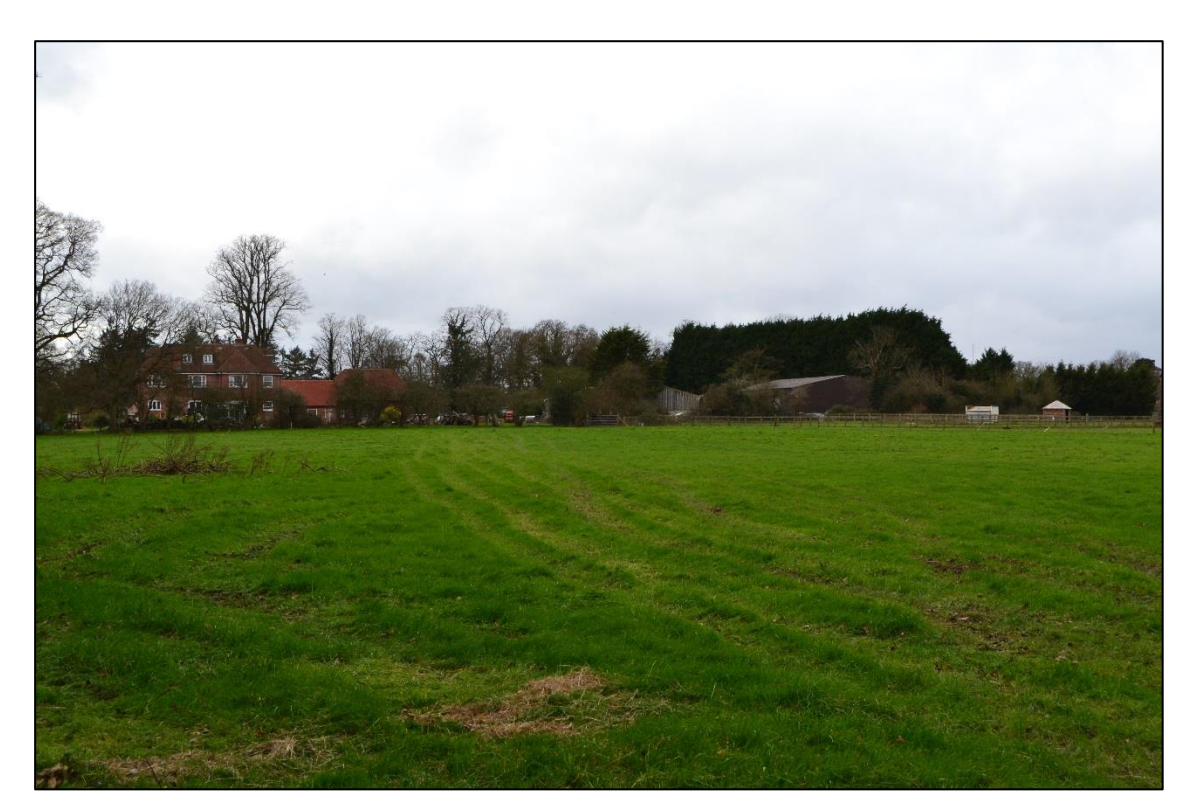
Figure 2 New Warren Farmhouse

Directly to the north of the site is Park House School, to the west is residential development characterised by detached dwellings on single plots (Wash Common) and to the east is open farmland which lies within the area of Sandleford Park controlled by Bloor Homes.. To the south is further open farmland and woodland forming part of New Warren Farm and the land associated with Wildwoods, a detached property lying south of Sanfoin, which has a largely wooded curtilage.