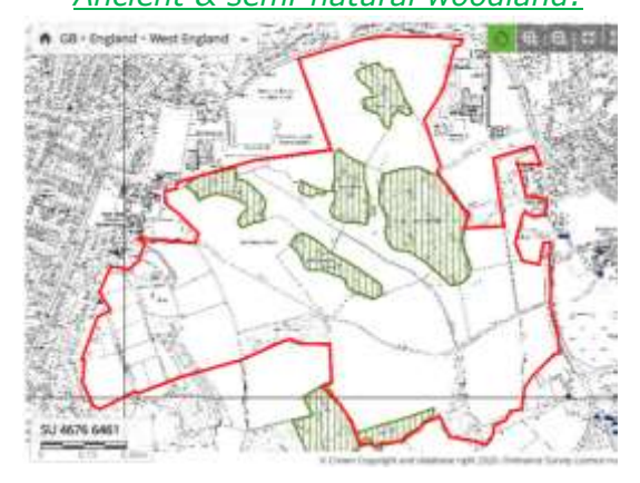
Priority Habitats (Woodland)