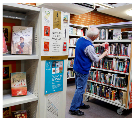
One of our volunteers shelving library stock