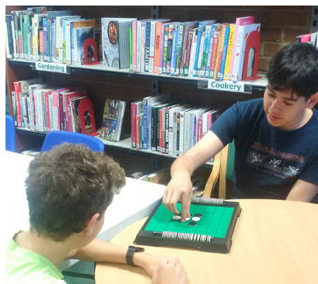
Mortimer Library Games Club