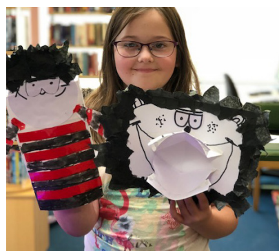
Dennis the Menace paper bag puppets