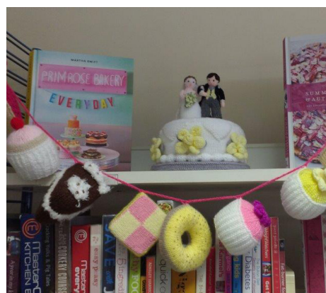
Yarn bombing craft activity

The number of visits to the library has increased over the last year which is very positive. One of our challenges has been to increase use of the library by children and young people, and during the year we have started to forge links with the local primary school. Children's craft activities during school holidays have also proved very popular.