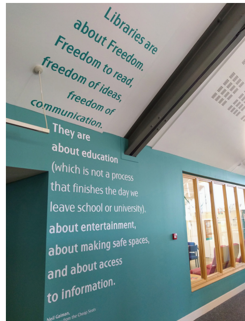
Neil Gaiman quote at Newbury Library