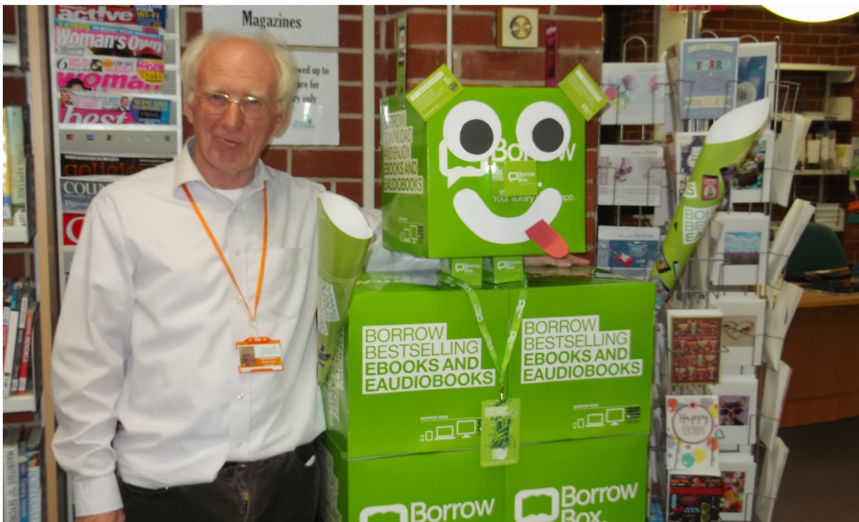
A volunteer helping to promote the e-library

We also consulted with volunteers about our proposed changes to the way that expenses are claimed. Many of our volunteers don't claim expenses and we appreciate this, but we do have a small fund to reimburse those who wish to claim. We agreed that from April 2019 volunteers can claim travel expenses within the West Berkshire borders.