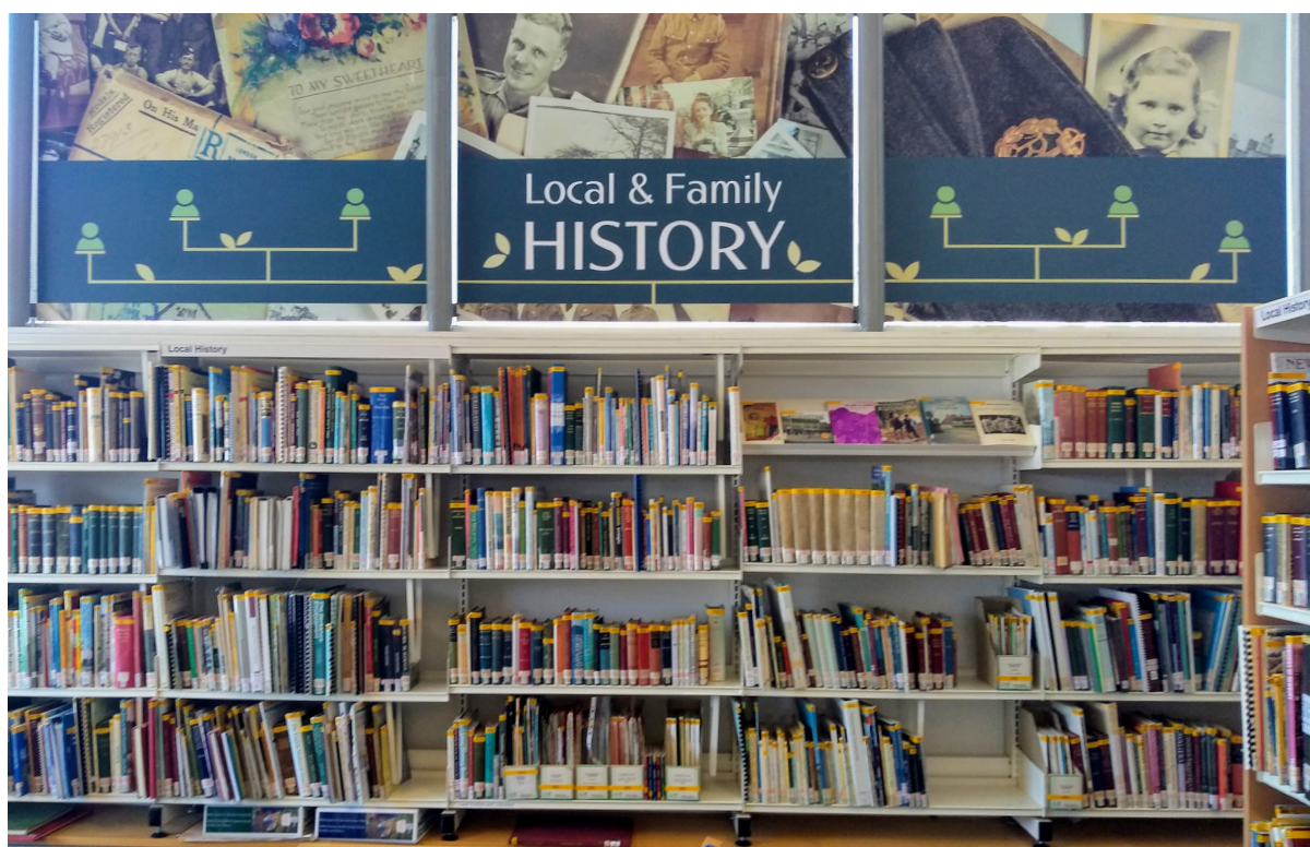
Refurbishment of Newbury Library Local & Family History Section