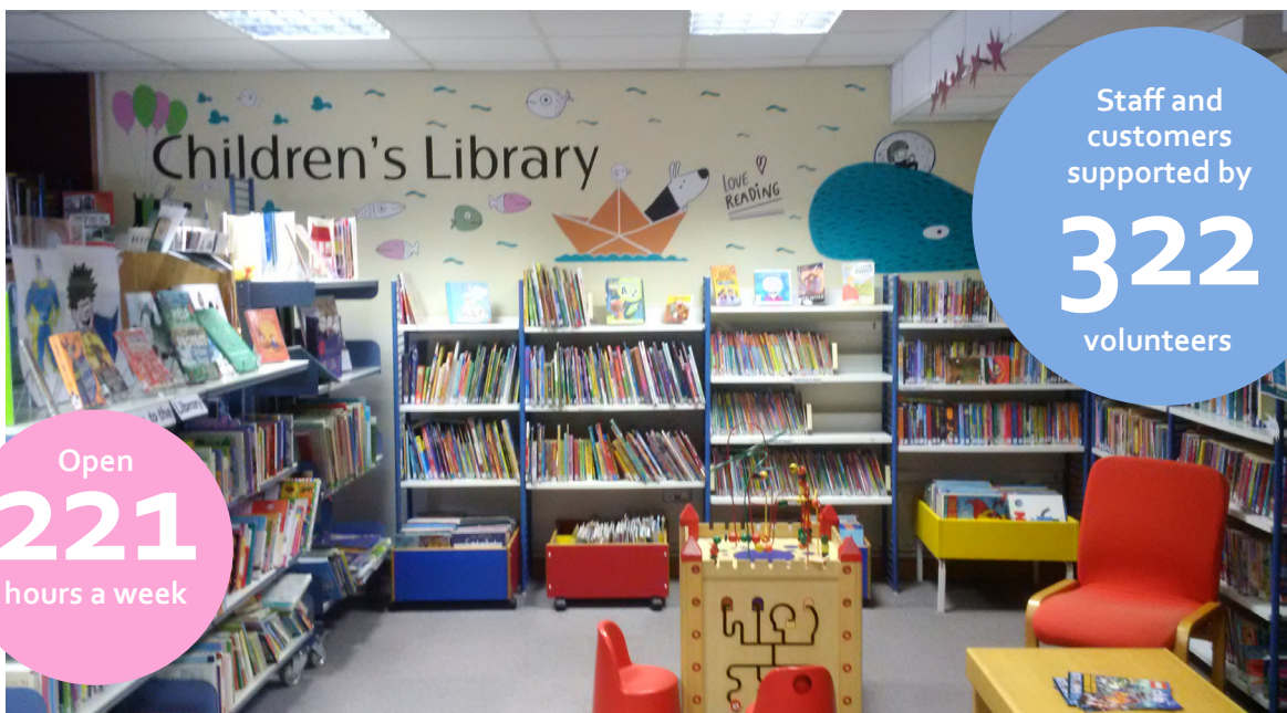
Lambourn Children's Library

In September 2018 we started our 'Message of the Month' initiative*, which has been really successful. The aim of this is to highlight certain areas of our service with branded promotions and advertising, and to combine this with staff training if needed. September focussed on our e-library, and we held practical drop-in sessions at some of our libraries to complement the promotion.