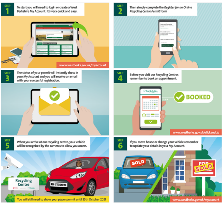
For more information including \ FAQs \ please \ visit \ \textbf{www.westberks.gov.uk/recyclingcentres}

The registration process for the digital permits is relatively straight-forward and can be done under 3 minutes. The process has bee summarised in the info-graphic below: