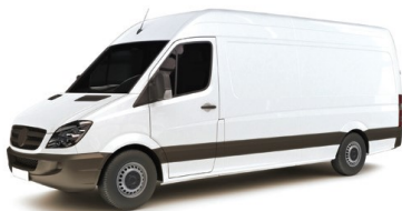
Vans exceeding 3 tonnes