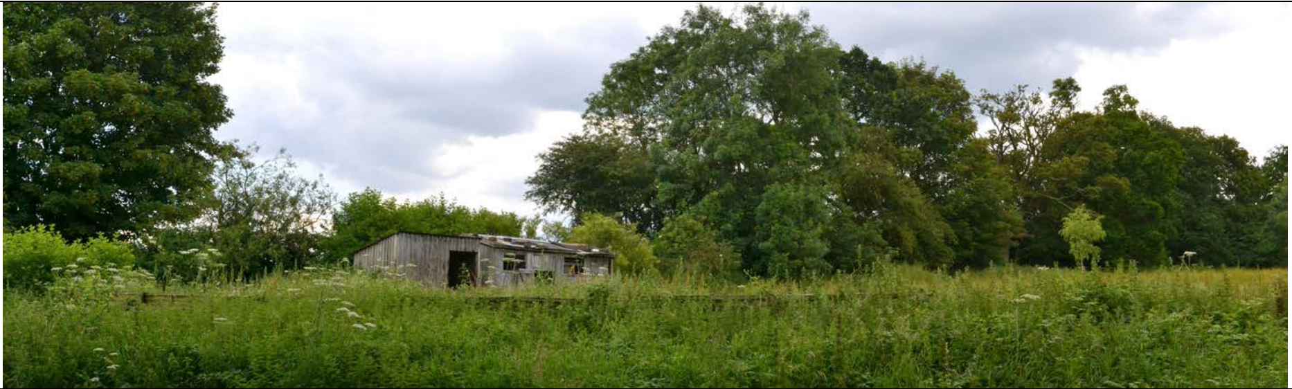
Viewpoint 1: View from B4009 looking to small shed and mature tree line on the northern edge of the site.