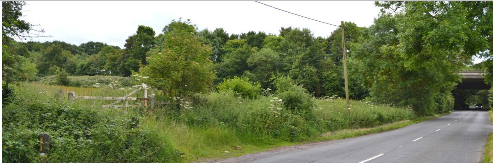
Viewpoint 2: View from B4009 looking south over the site to the M4 (largely hidden behind the mature trees)