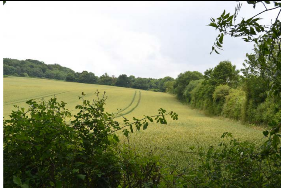
Viewpoint 3: View from Restricted Byway to the north of the site, over open field to mature trees and the gap in tree line on northern edge of the site