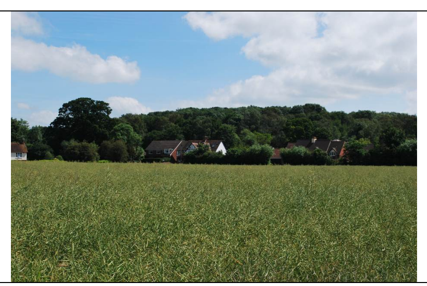
Viewpoint 2: Characteristic view of wooded skyline viewed from the footpath crossing the site. The settlement edge is largely well vegetated