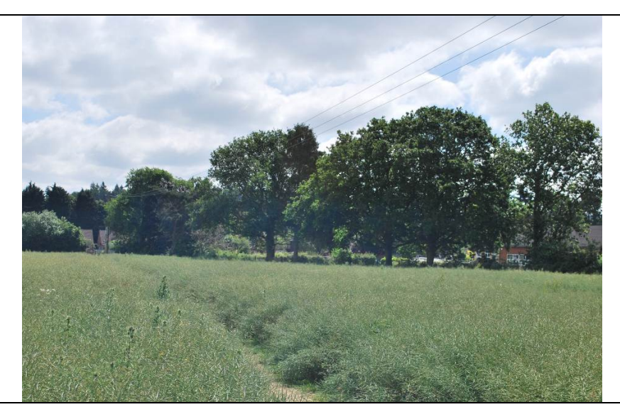
Viewpoint 3: Mature oaks and gappy hedge along southern boundary with the school