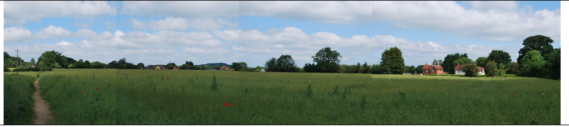
Viewpoint 4: Sparsely settled Manor Lane (right – centre) leading to the small hamlet of Oare (centre – left) – from the public footpath crossing the site. Glimpses of the wider AONB and M4 corridor to the west – north west