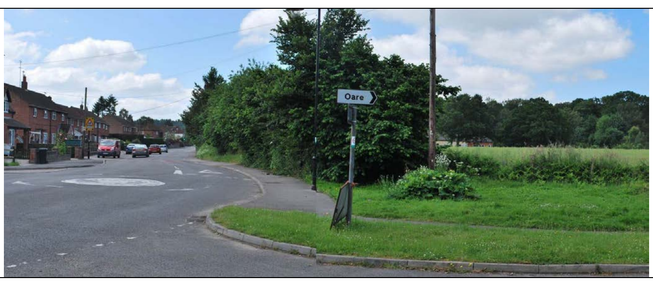
Viewpoint 1: The eastern edge of site (right of the photograph) is adjacent to the settlement with a mature hedge. The school is visible (centre, right) to the south