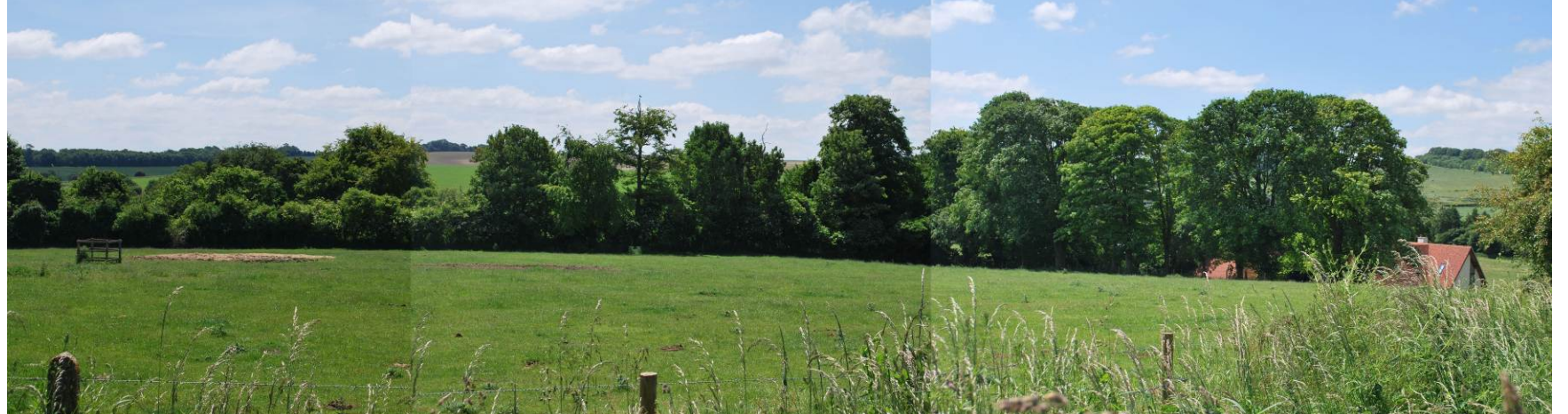
Viewpoint 3: The northern part of site visually prominent in views from the PRoW along northern boundary