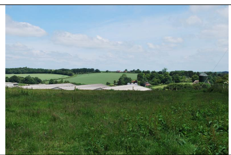
Viewpoint 2: View from Cheseridge Road on high ground to south west. Much of site would be visible in winter.