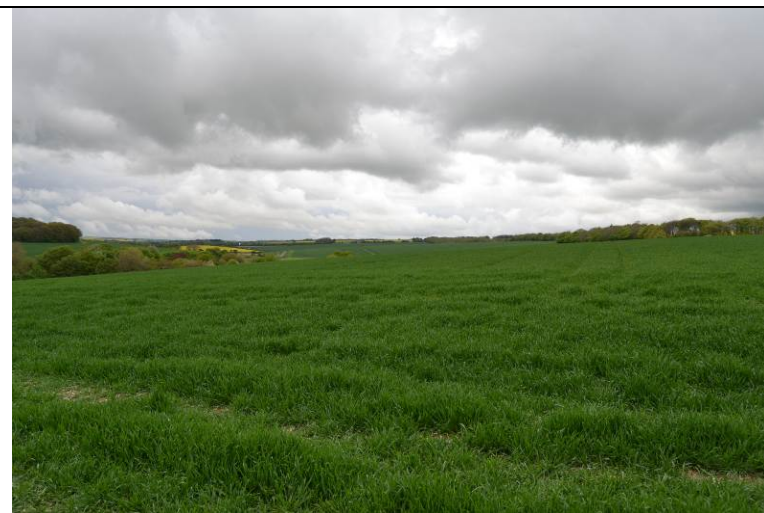
Viewpoint I: Long views north from PRoW along northern boundary. Built form on higher ground in northern part of site would be widely visible from the AONB