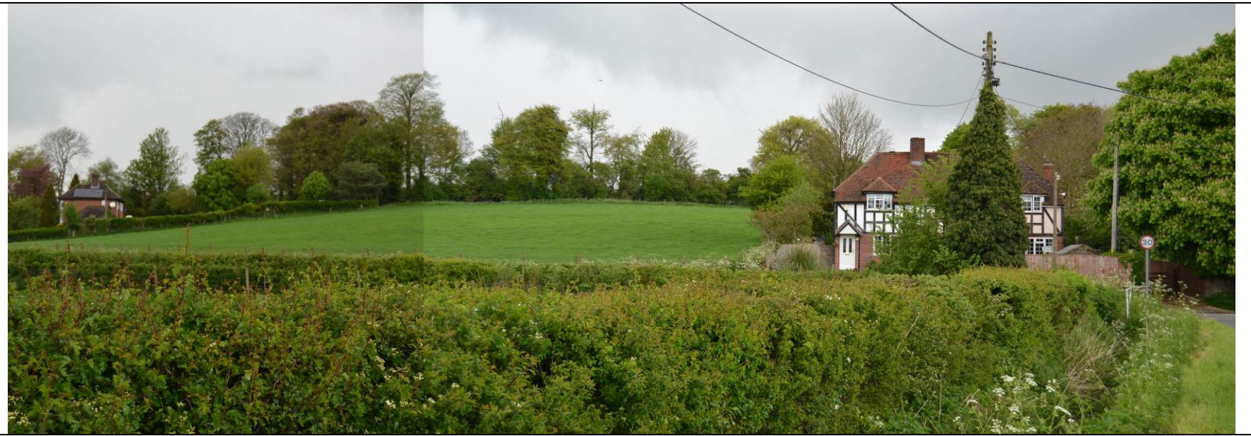
Viewpoint 4: The southern part of site visually prominent and forming a wooded skyline in views from the valley to the south (from Ilsley Road)