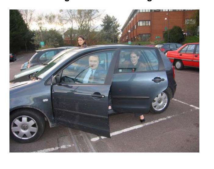
Figure 3-1 Car Sharing

Car Sharing is when two or more people travel together in a car. People can benefit from shared fuel costs, greater chance of getting a parking space as well as the convenience of the car and knowing that they are helping to reduce congestion and pollution. Car sharing is often promoted as part of business travel plans as a way of reducing peak time traffic and pressure of car parking. But car sharing can also be used for leisure trips, the school run and for all kinds of other journeys.