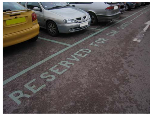
Figure 3-4 Dedicated Car Sharing Spaces

car share scheme would enable people to find new car sharing partners for regular journeys as well as for one-off journeys. There are a number of potential providers for car share databases, and there is potential to work with local businesses, through their travel plans, to develop a system which works for them, as well as for West Berkshire as a whole.