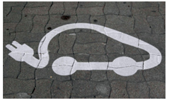
Figure 4-2 Electric vehicle charging point and parking space

There are a number of charging points in the UK, both on-street and in public car parks. Charging could also potentially take place at home, at work, or using a public charging point.