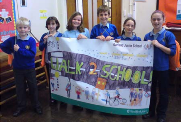
Figure 2-3 Garland Junior School's Walk to School Banner

In recent years there have not been many housing developments which have required a residential travel plan to be developed. Where there has been a requirement (a few of the larger developments) the Council has worked with the developers to introduce travel plans which will really encourage residents to consider how they travel to and from the site. Changes, such as moving house, provide an ideal opportunity to encourage people to consider changing how they travel and establish new habits based with more of an emphasis on sustainable modes of travel than might have been considered before.