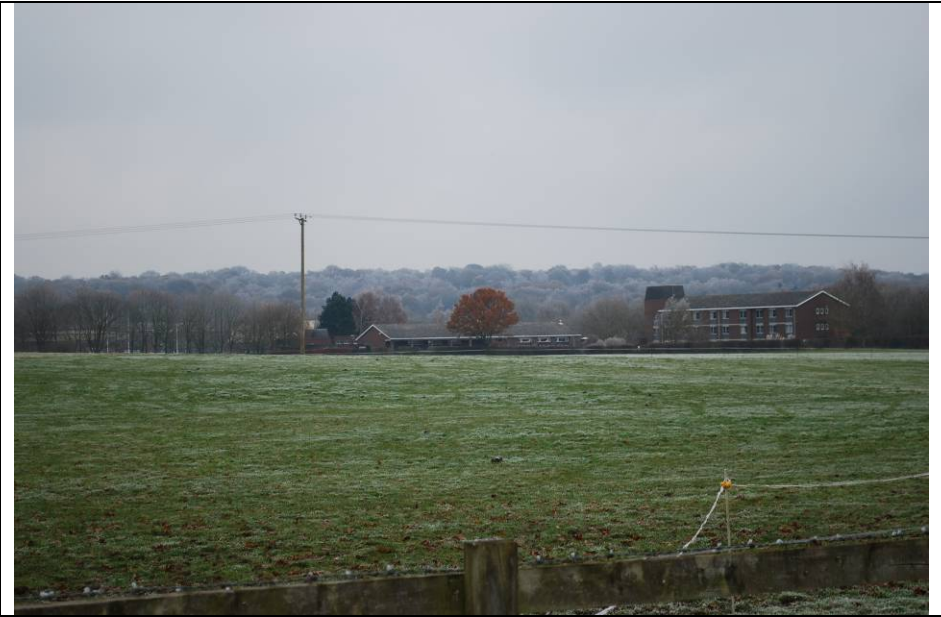
View north from PROW to south west