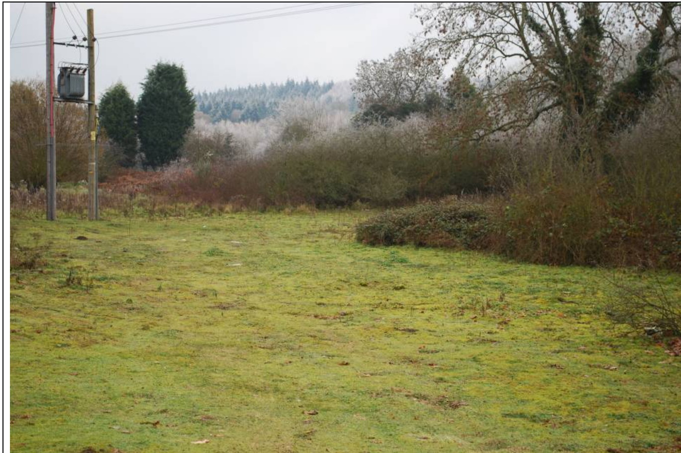
View into site with wooded slopes behind from Charlotte Close, off Newbury Road