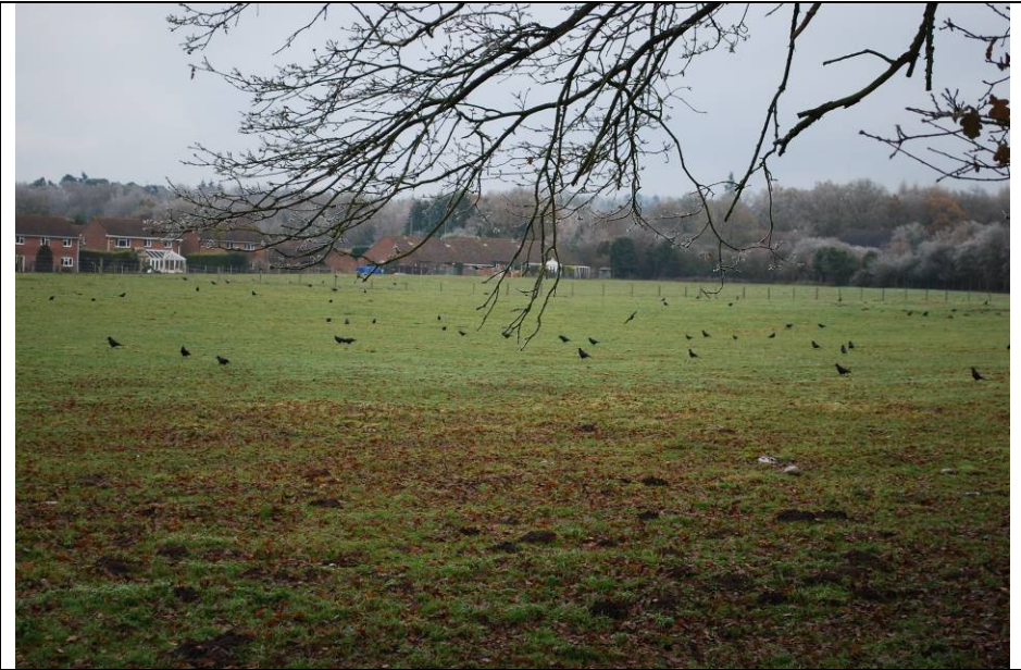
View north over site to wooded slopes from access road to Hermitage Green