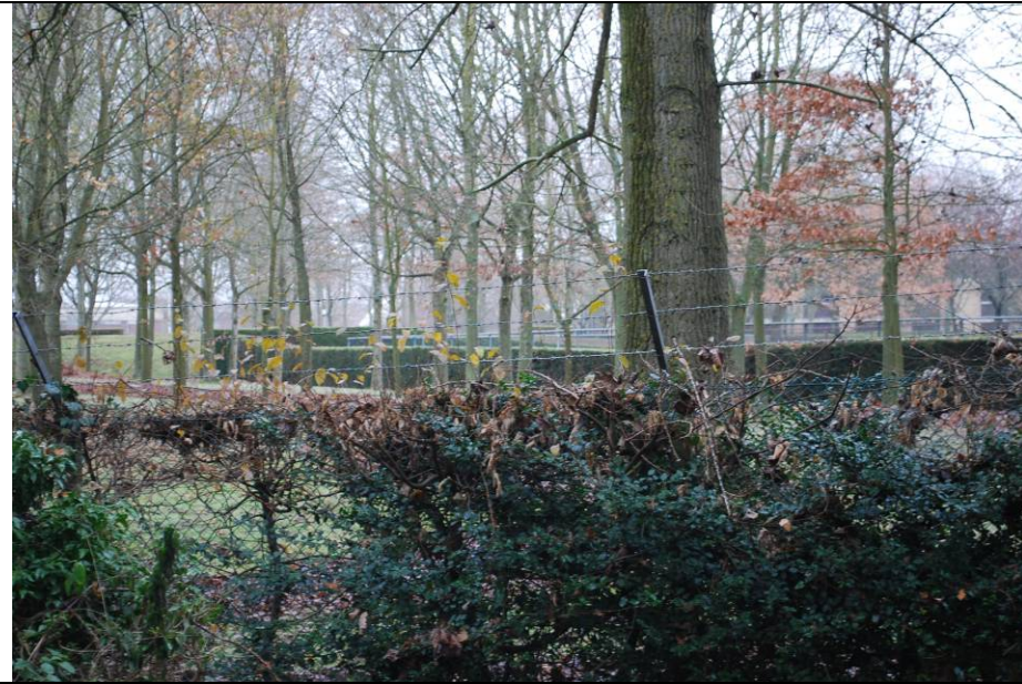
View of east part of site from Crabtree Lane