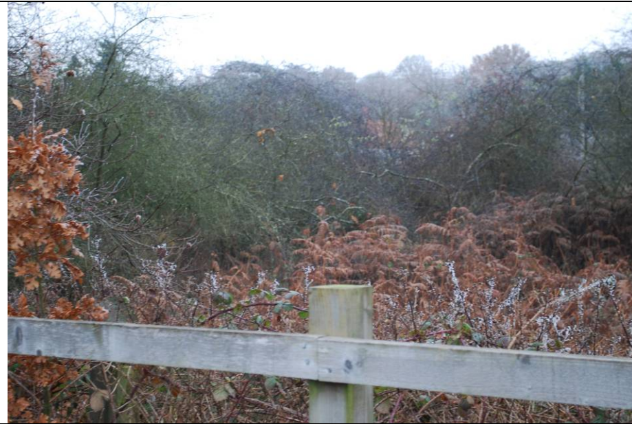
View north into site from access road to Hermitage Green