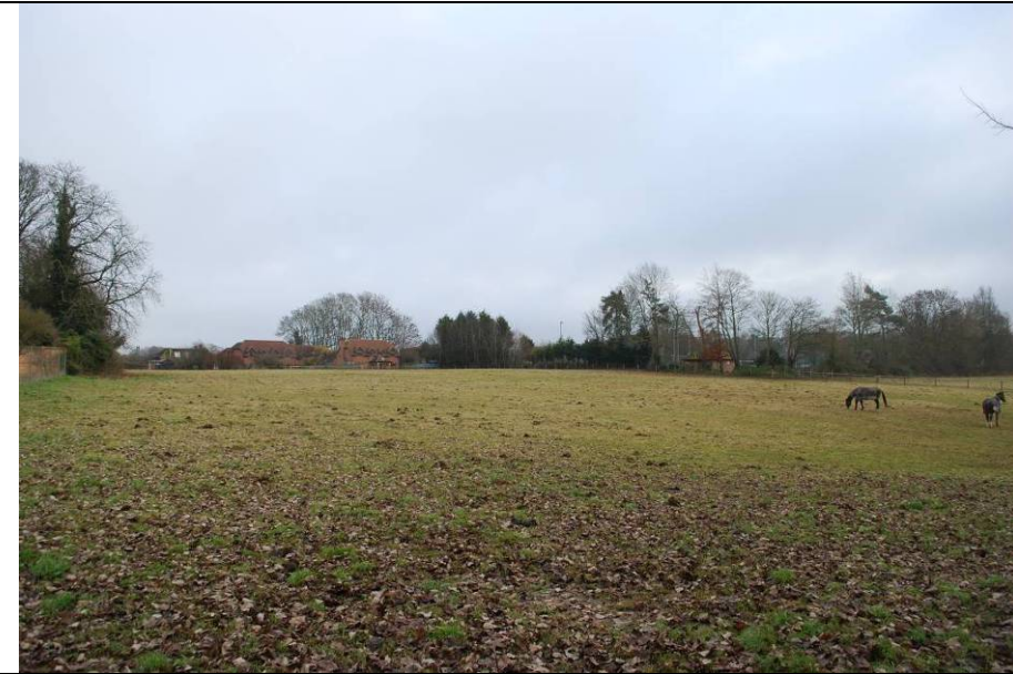
View of north part of site from public footpath in northwest corner