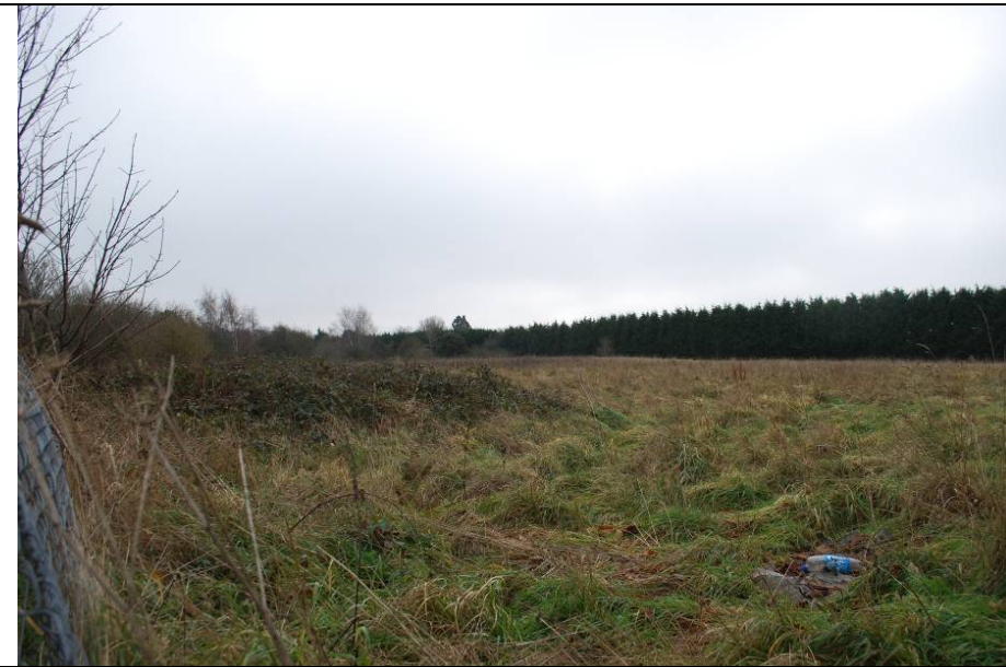
View south from housing to east