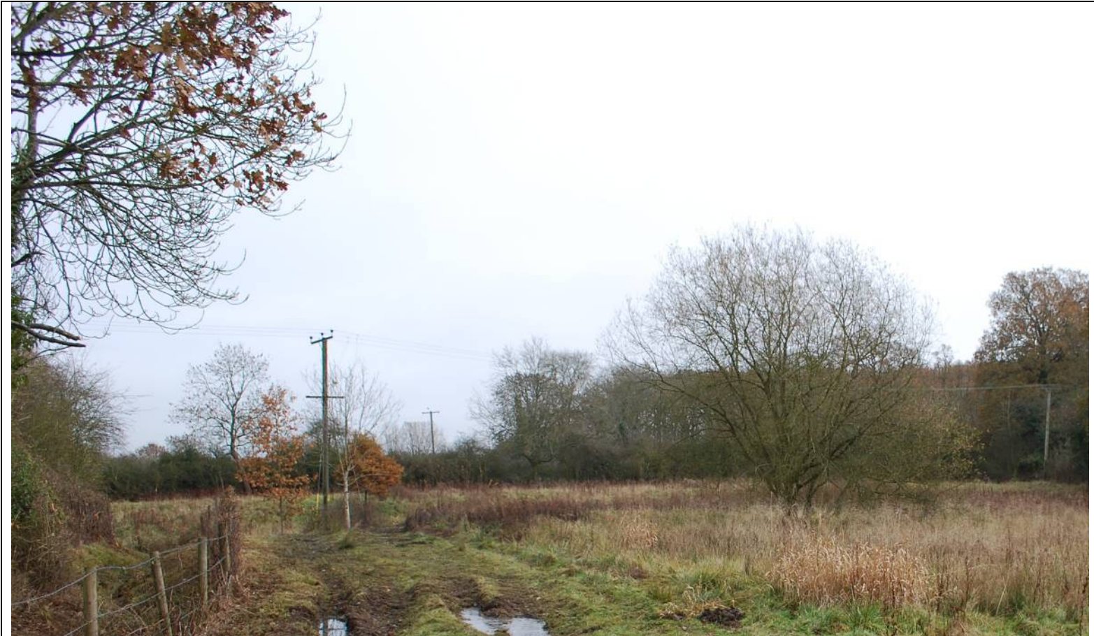
View of site across KIN006 in foreground, from lane