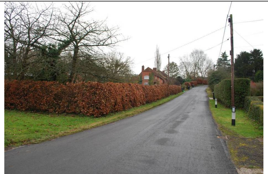
View south along lane west side of site