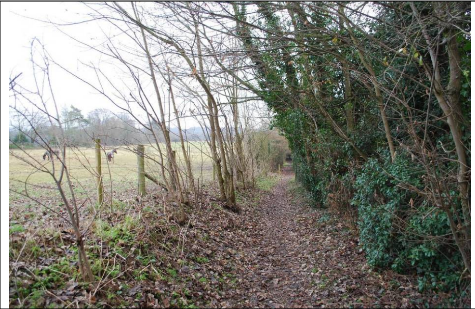
View south, from public footpath in northwest