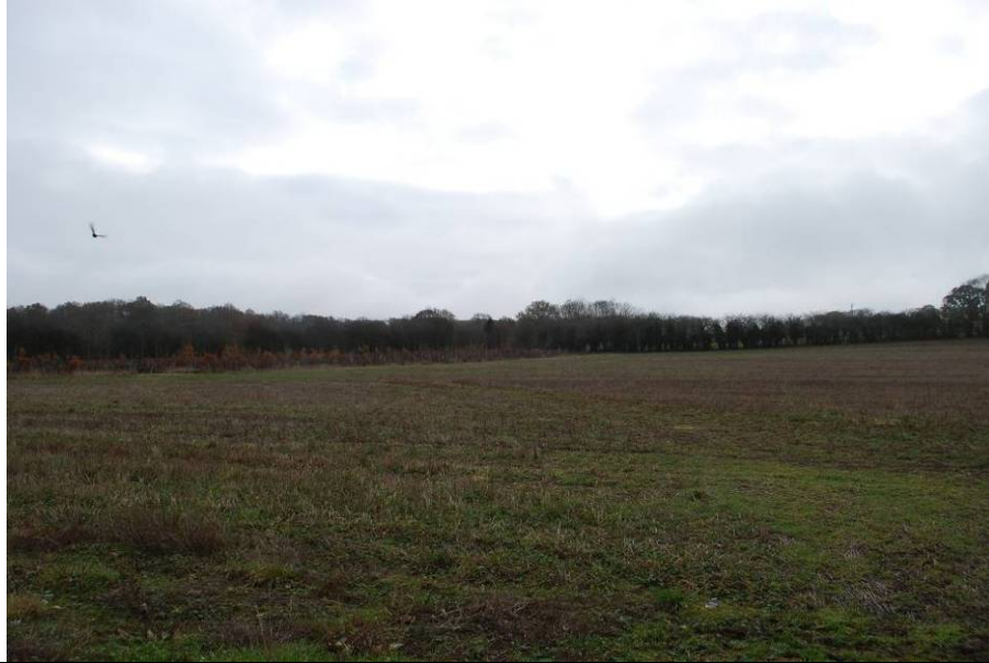
View south, from lane north east of site