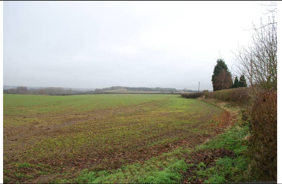
View east from lane at south west corner of site