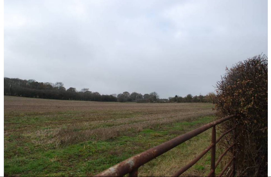
View west from lane north east of site