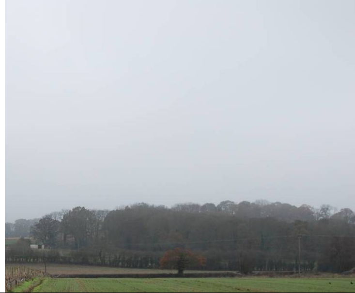
Partial view of site across KIN008