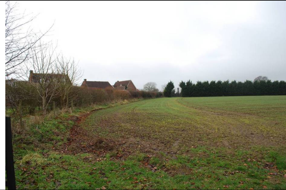
View west from lane at south east corner of site