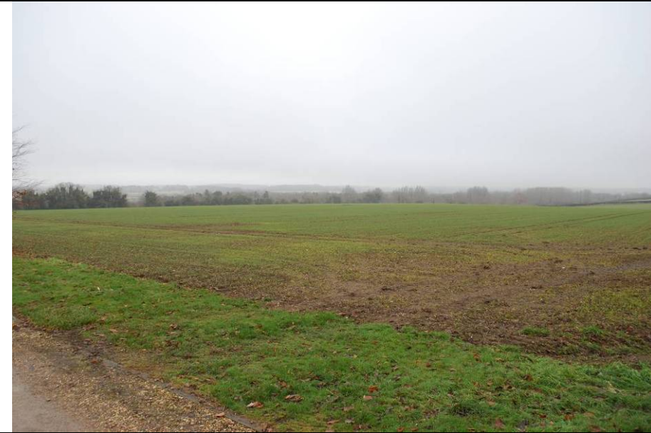
View north from lane at south west corner of site