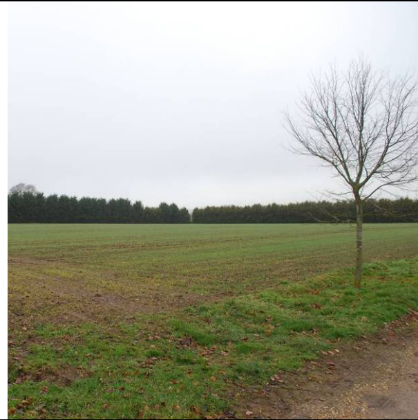
View north from lane at south east corner of site