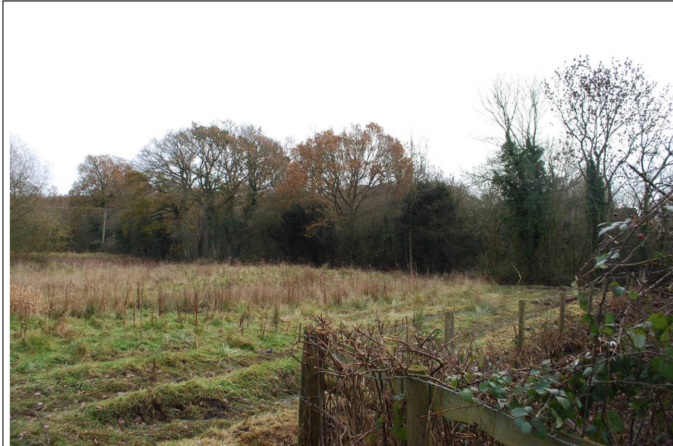
View of site from lane