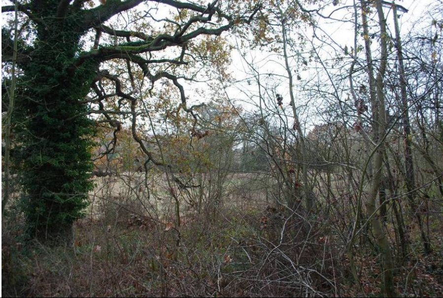
Glimpsed view of site from housing to north