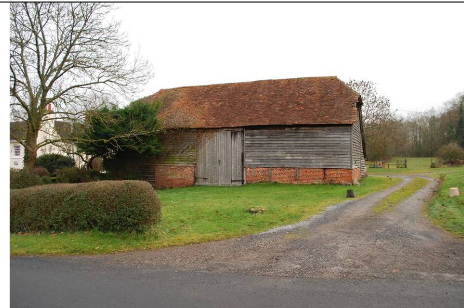
View of site entrance from lane