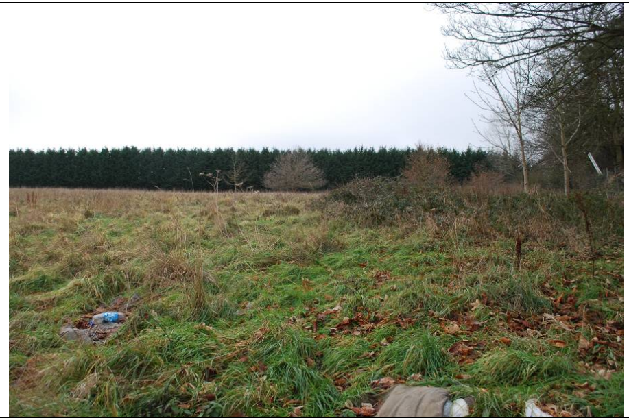
View west from housing to east