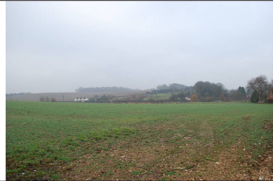
View south west from driveway and PROW on north west side of site