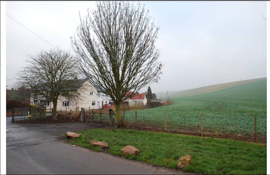
View north from driveway and PROW on north west side of site