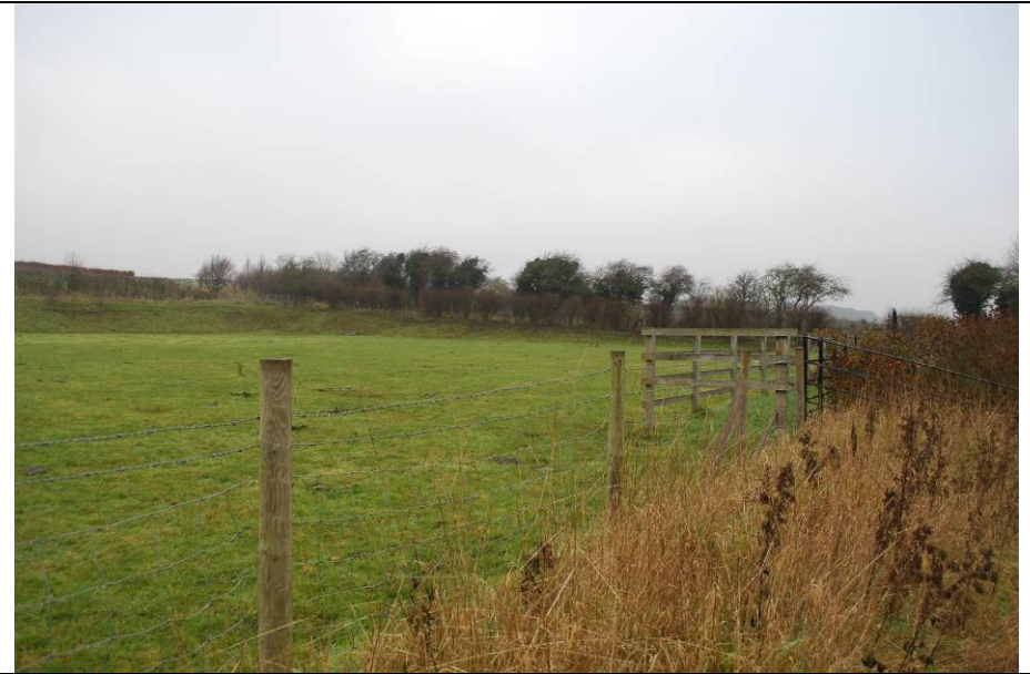
View north from housing to east