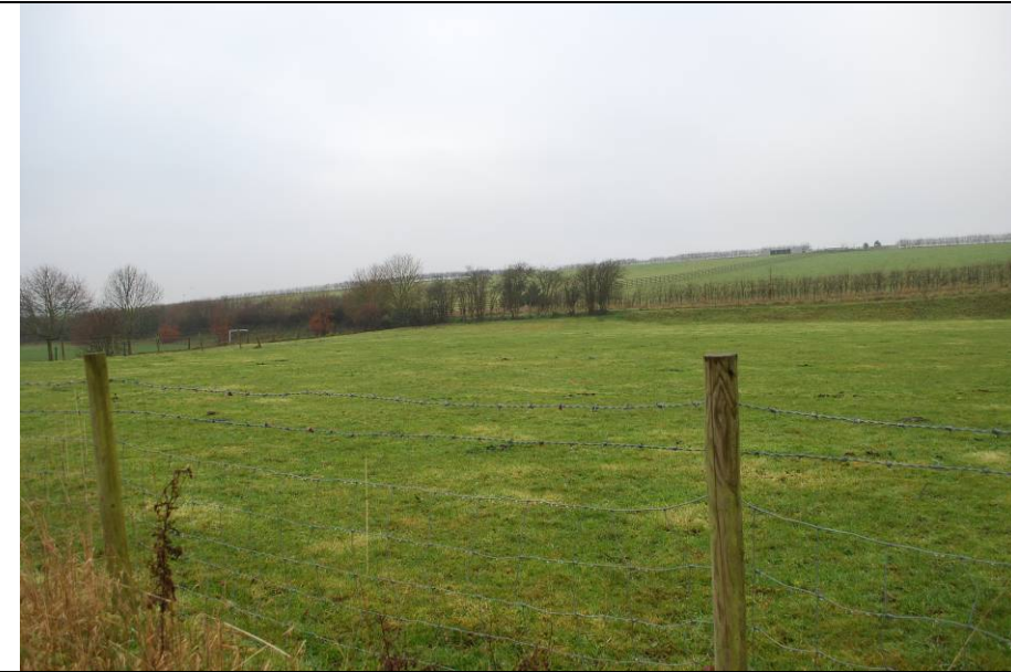
View west from housing to east